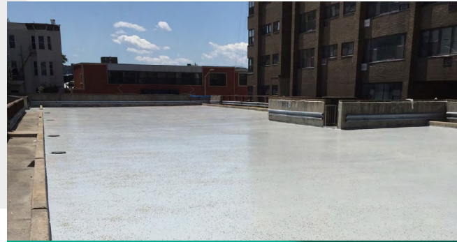
Completed System Prior to Asphalt Topping