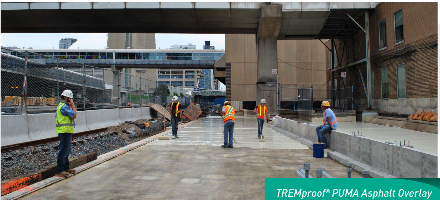
TREMProof® PUMA Asphalt Overlay Application