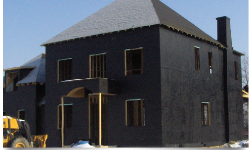
After Enviro-Dri Weather-Resistant Barrier System