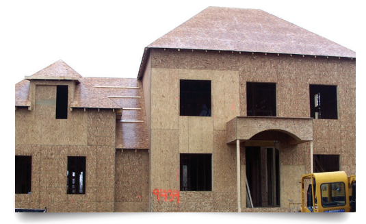
Before Enviro-Dri Weather-Resistant Barrier System