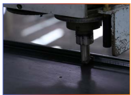
EXAMPLE OF AUTOMATED APPLICATION

3735 Green Road Beachwood, OH 44122 216.292.5000 • 800.321.7906