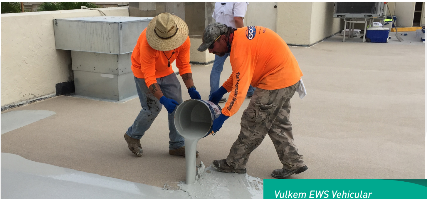
Vulkem EWS Vehicular system application