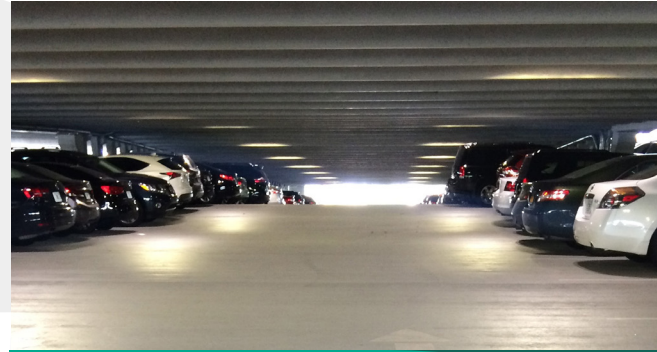
Vulkem® EWS Vehicular system complete project