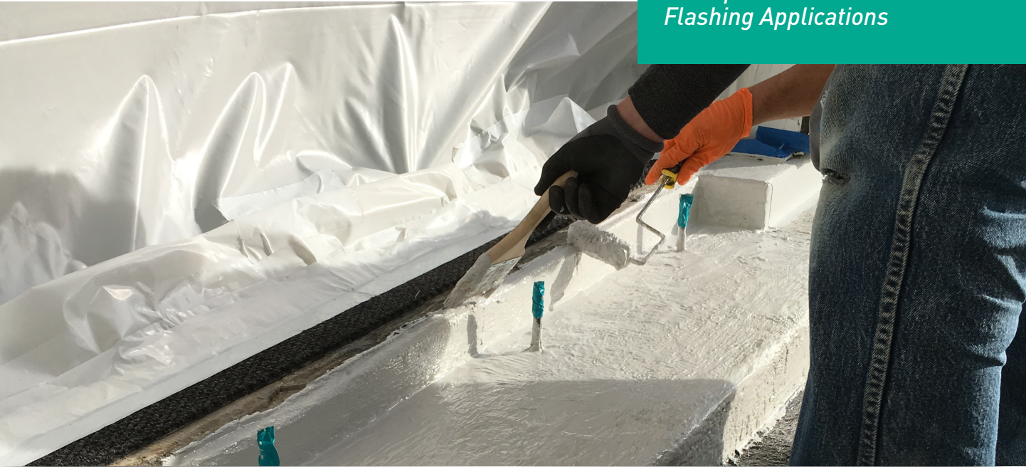
TREMproof PUMA For Decorative Flashing Applications